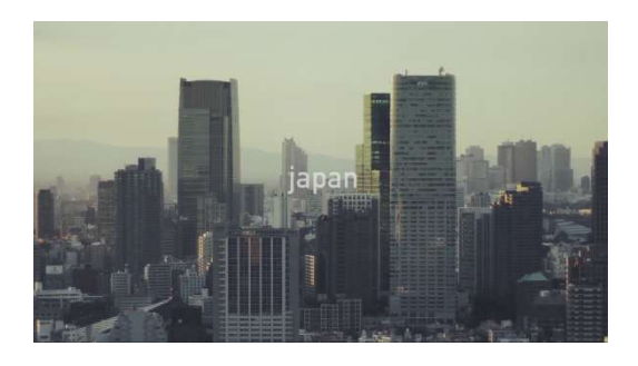
NEW IDEA VIDEO teamtravel international GmbH